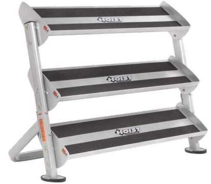
*SHOWN WITH OPTIONAL 3RD-TIER (HF-5461-OPT-36)