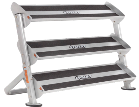
*SHOWN WITH OPTIONAL 3RD-TIER (HF-5461-OPT-48)