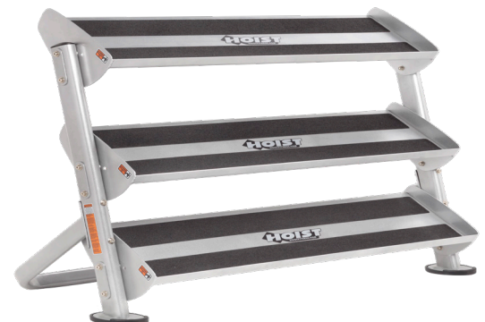
*SHOWN WITH OPTIONAL 3RD-TIER (HF-5461-OPT-60)